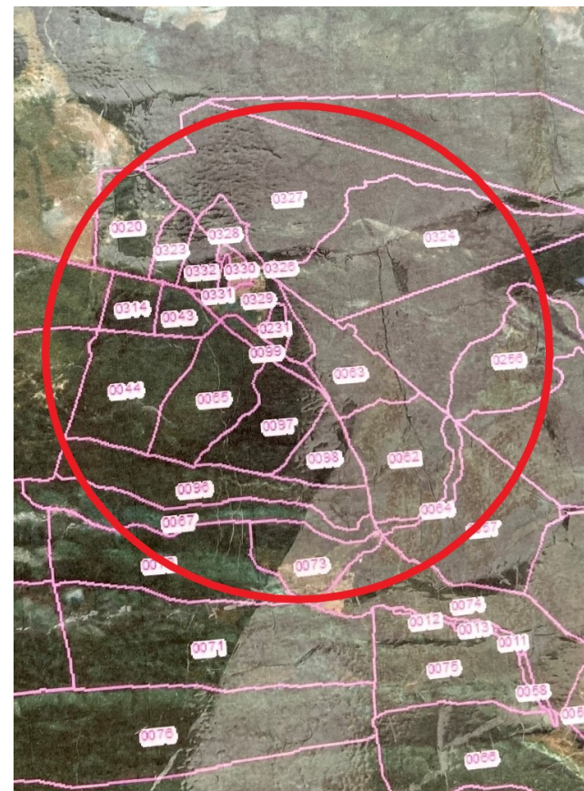
Figure 4. Potberg section – mini compartment Nbal numbers encircled and as tabled.