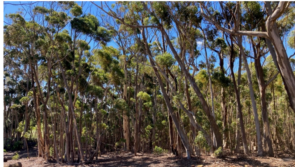
Figures 1 & 2. Examples of unmanaged bluegum tree woodlots for harvesting at the Potberg section within the De Hoop Nature Reserve.