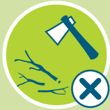
COLLECTING OF FIREWOOD