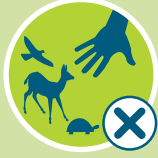
DISTURBING OF ANY WILDLIFE