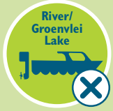
FUEL OUTBOARD ENGINES (RIVER/LAKE)