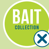
COLLECTING OF BAIT