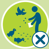
FEEDING OF ANY ANIMALS