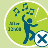
LOUD MUSIC & ROWDY BEHAVIOUR