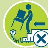
RE-ARRANGING FURNITURE & EQUIPMENT OR TAKING OUTDOORS