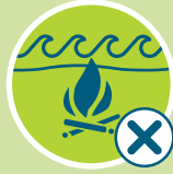
MAKING FIRES ON THE BEACH