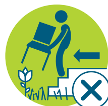
TAKING FURNITURE EQUIPMENT OR UTENSILS OUT OF THE HUT