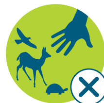
DISTURBING OF ANY WILDLIFE