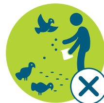
FEEDING OF ANY ANIMALS