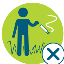
THROWING CIGARETTE BUTTS INTO THE VELD