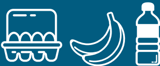
FOOD + DRINKS