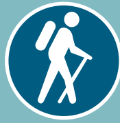
HIKING & WALKING